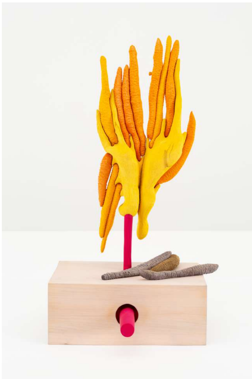
Matthew Ronay Succuloid , 2019 Basswood, dye, gouache, flocking, plastic, steel 58,4 x 40,6 x 38,1 cm (23 x 12 3/4 x 13 1/2 in) Signature carved into bottom (Inv# MRo 19 012)