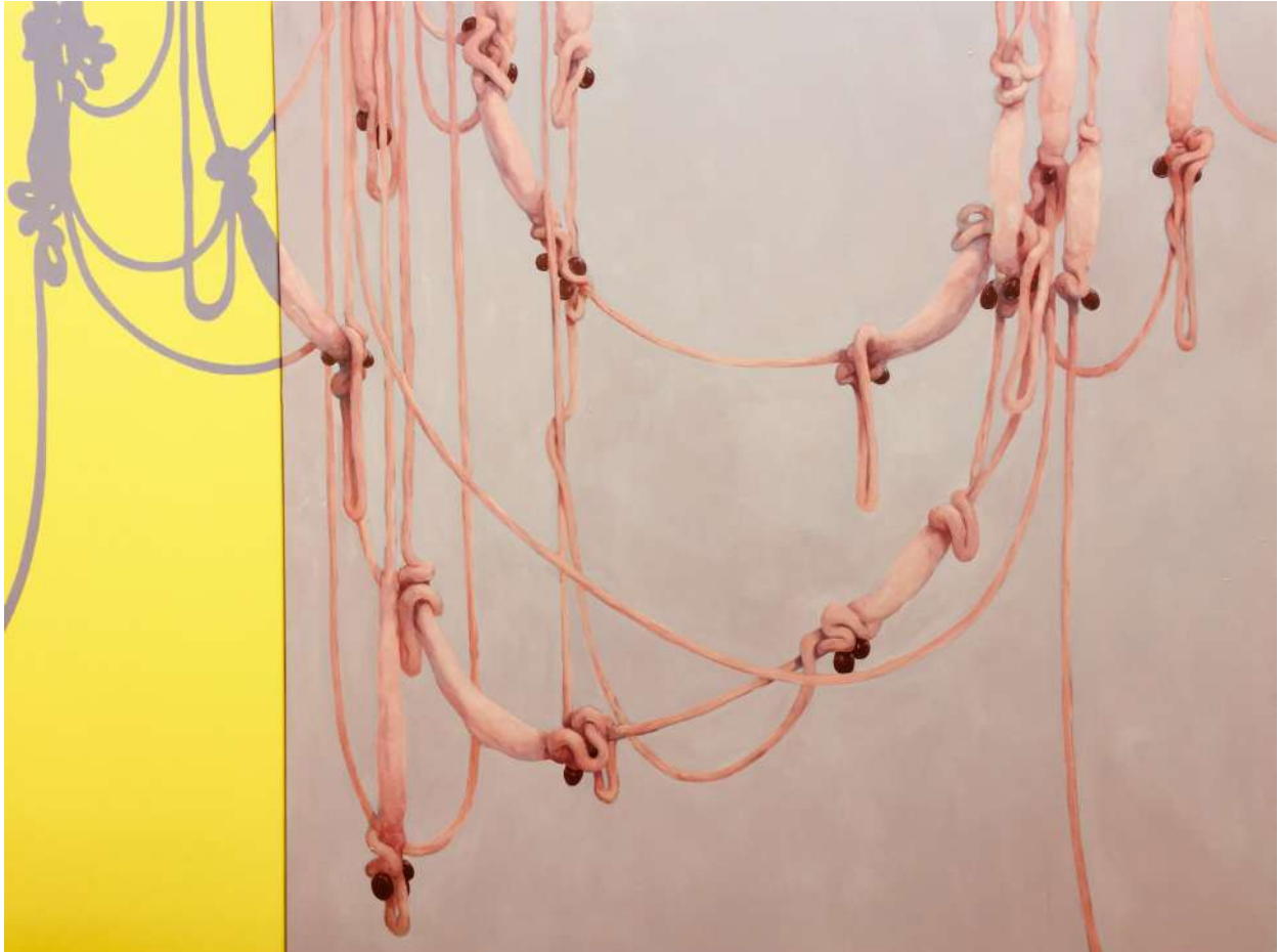
Michael Kvium Ambient Painting I , 2018 Oil on canvas 200 x 260 cm (Two parts each 200 x 60 cm and 200 x 200 cm) (Inv# MKv 18 071)