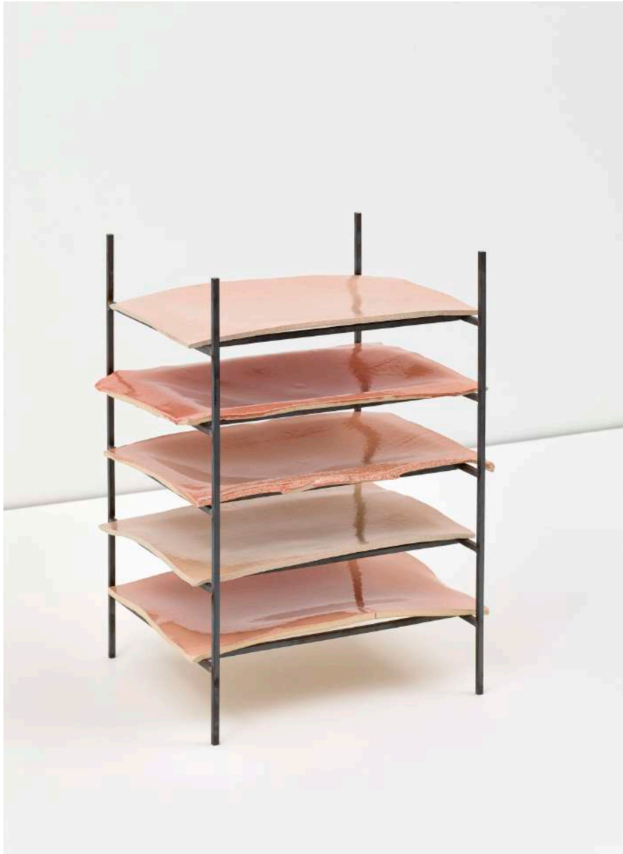
Tove Storch Untitled No. II , 2019 Ceramic, steel 39 x 33 x 27,5 cm (15,35 x 12,99 x 10,83 in) (Inv# TS 19 017)