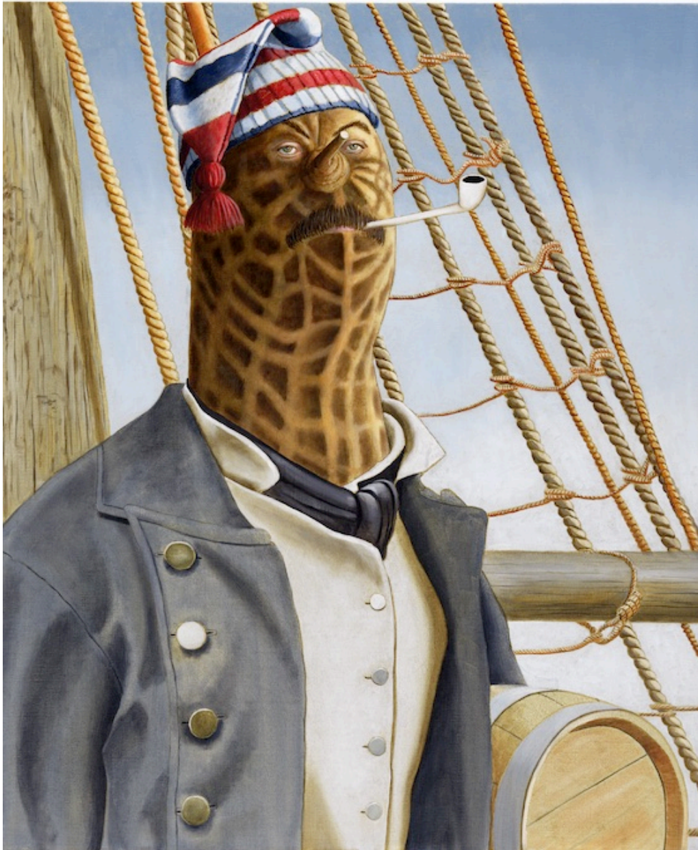
Sean Landers 19th Century Sailor , 2019 Oil on linen 86,4 x 71,1 cm (34 x 28 in) (Inv# SL 19 006)