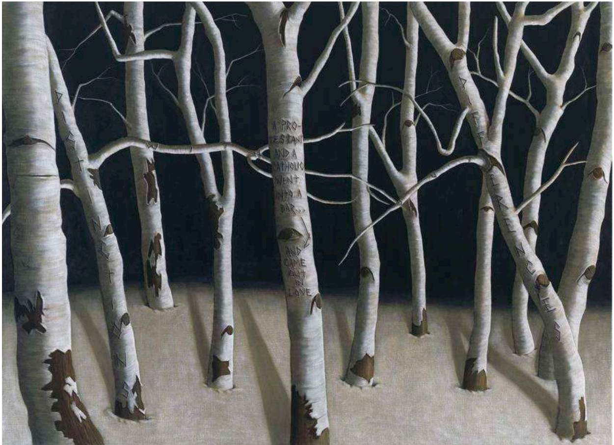
Sean Landers Distinctions Without Differences , 2017 Oil on canvas 160 x 218.4 cm 63 x 86 inches (Inv# SLa 17 001)