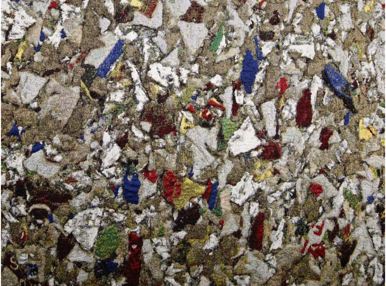
Miriam Bäckström New Enter Image III , 2016 Tapestry. Wool, cotton and acrylic 287 x 508 cm 112.99 x 200 inches (Inv# MBä 16 002)