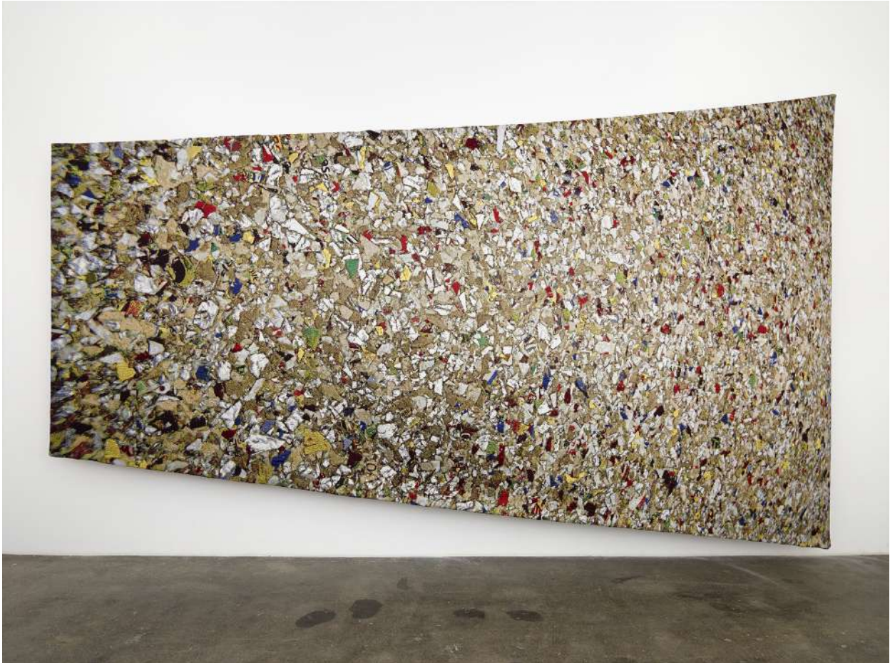
Miriam Bäckström New Enter Image III , 2016 Tapestry. Wool, cotton and acrylic 287 x 508 cm 112.99 x 200 inches (Inv# MBä 16 002)