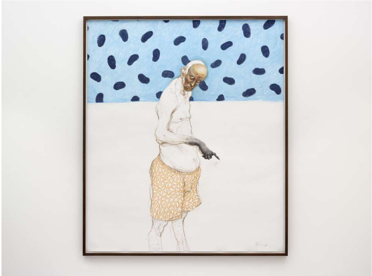
Michael Kvium Performing man , 2018 Chalk and pastel on paper 185 x 150 cm (72,83 x 59,06 in) (Inv# MKv 18 051)