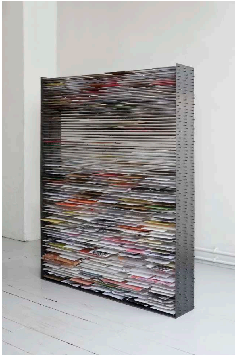
Tove Storch Untitled, 2017 steel, mixed media on paper, magnets. 195 x 153 x 30 cm 76.77 x 60.24 x 11.81 inches (Inv# TS 17 007)