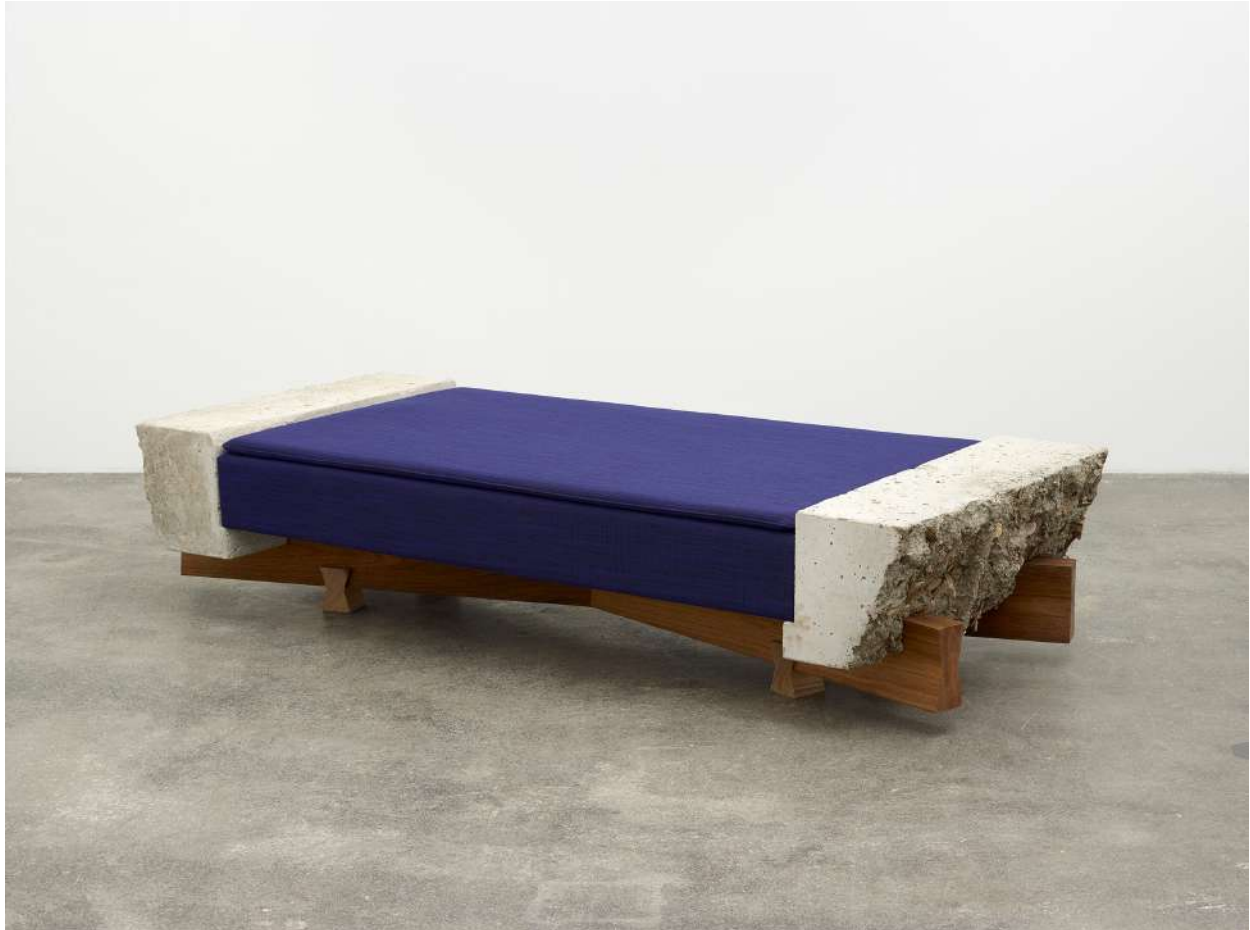
FOS Small Couch (blue) , 2018 Concrete, wood 44.1 x 212.5 x 90 cm (Inv# FoD 18 011)