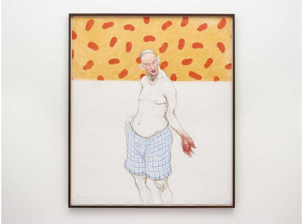
Michael Kvium Performing man , 2018 Chalk and pastel on paper 185 x 150 cm (72,83 x 59,06 in) (Inv# MKv 18 049)